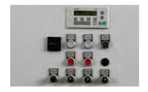
The PLC controls ensure user friendly, fully automatic operation Option: with info display