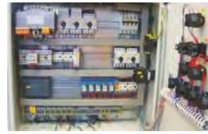
PLC controls / control cabinet