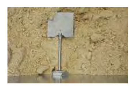
Option: The fill level indicator