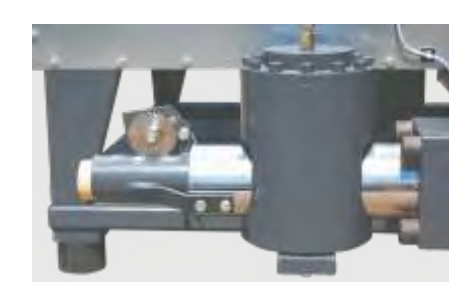
Strand length monitor attachment for automatic briquett lenght regulation