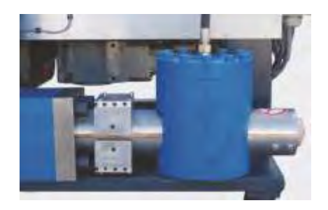
Option: cooling system for the presstong