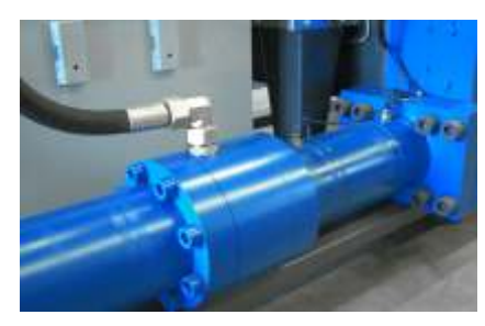
Strong pressing operation by amply dimensioned cylinder